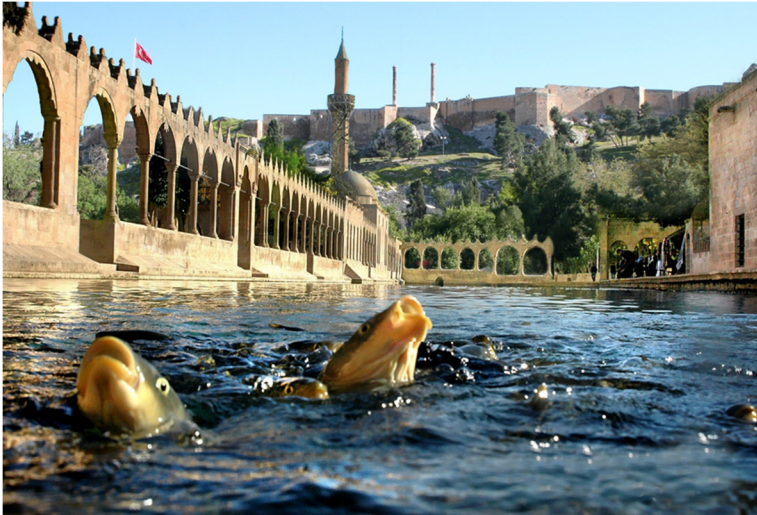
The sacred pool at Urfa /Edessa with fish

No wonder that it was said to have been visited by Abraham, and considered sacred by Jews, Christians and Muslims alike. My memory is of buildings of all periods, Greek, Roman, Early Christian, Crusader and Muslim, many still inhabited. One could see tombs inscribed in a variety of languages, as well as a handful of Eastern orthodox churches. There was a hill with, again, a crusader castle on top, and a bustling market at its foot, for Urfa was a major trading centre with North Syria, but, alas, no trace of the famous theological school said to be founded by King Abgar, an early convert of St Thomas and the first monarch to bring his subjects to Christianity. It introduced me to a new world of Eastern Christianity, aspects of which, most notably its charitable work, I could include in my thesis.