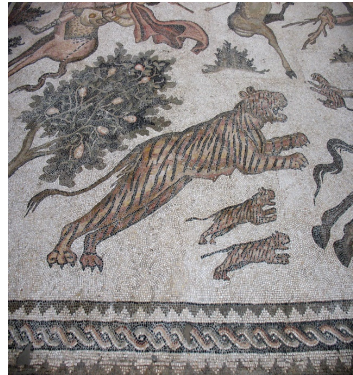
A mosaic from Roman Antioch

Antioch/Antakya was then a sleepy town on the tree-lined banks of the river Orontes, nestling under a high hill surmounted by a crusader castle. I climbed up to see the church built into the hillside where St Paul was said to have preached to the first Christians (the name was first applied there), but my main interest was in the Museum. Here one could see some of the most beautiful of ancient mosaics, many brought from nearby Daphne and showing the huge wealth of the city around 300 AD. There