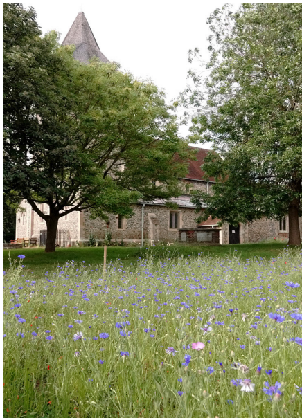
Cornflowers in the churchyard

IF YOU WOULD LIKE TO ADVERTISE HERE IN A HALF, A QUARTER, OR EVEN AN EIGHTH PAGE, PLEASE CONTACT: