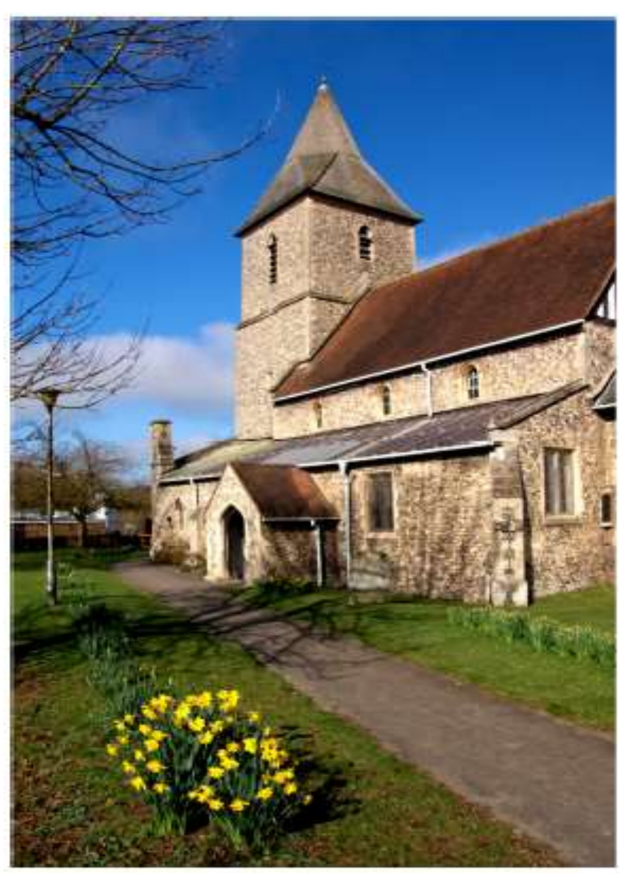
APCM MEETING—Sunday April 23rd 2017