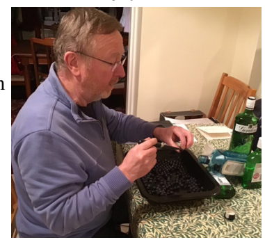
Preparing the sloes