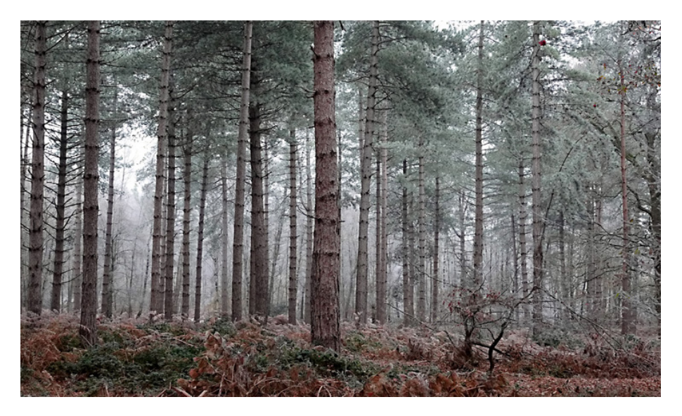
A frosty day last winter