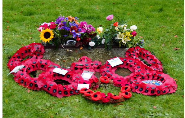
Left: Poppy wreaths laid in the Garden of Rest