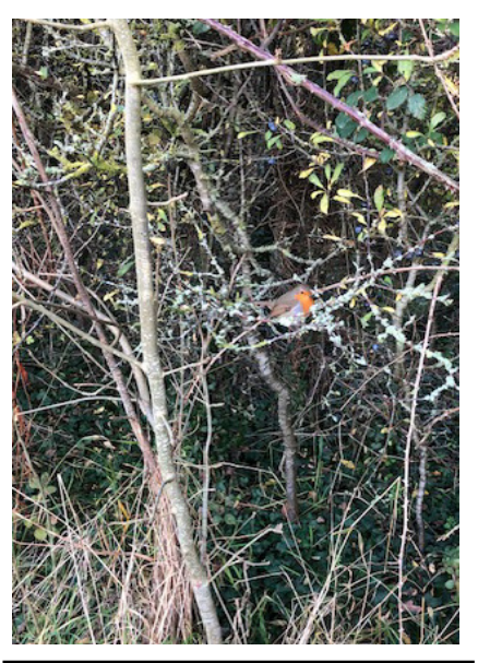
A Christmas robin in amongst the sloes