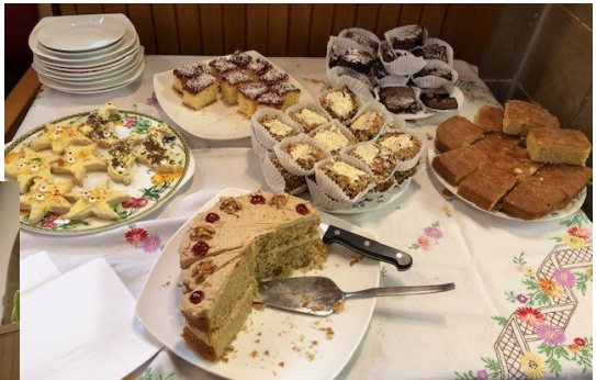
Below: August teas on first Sunday of the month